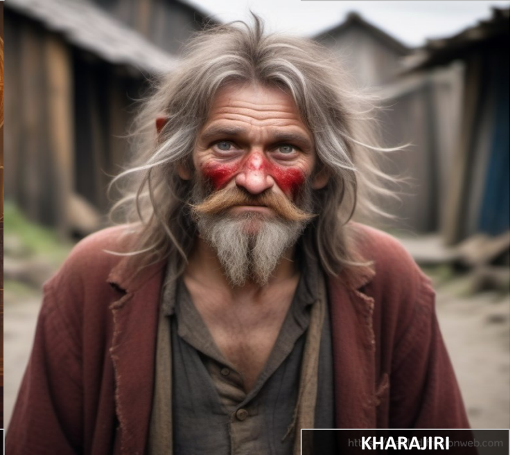
ht KHARAJIRI nweb.com