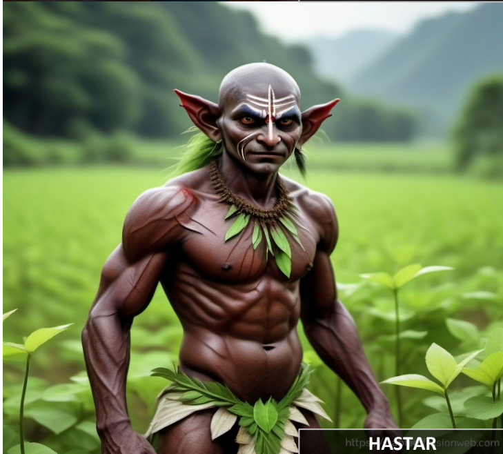
http HASTAR ionweb.com