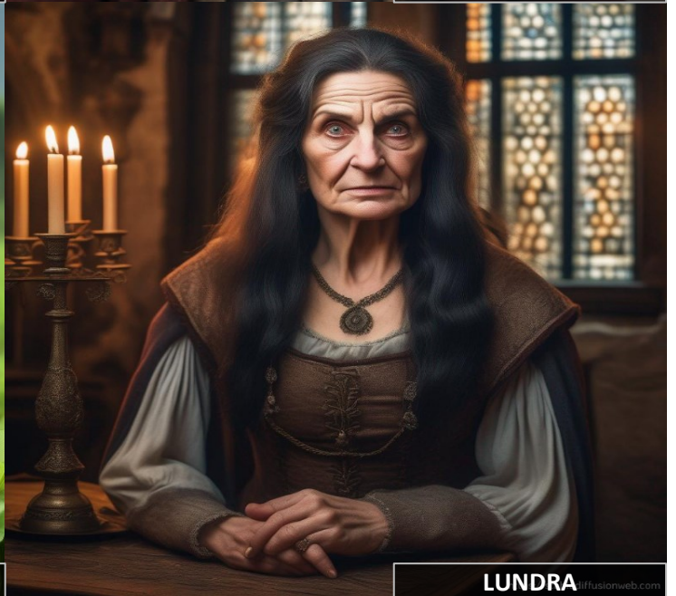
LUNDR A fusionweb.com