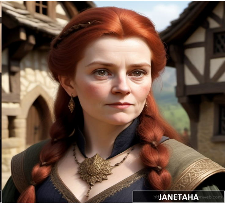
ht JANETAHA nweb.com